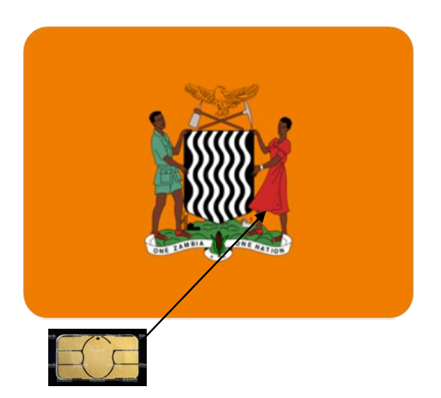
This chip to be at the centre of the card

The same format to be at the back of the card, a microchip at the centre. These features can be changed depending on the majority demand ,but for me this so far is the best ,the decissions is left to those in government authority .