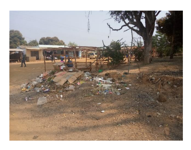
Picture 1: Roadside Dumping of waste in the Central Business District.

waste by burying in their yards, 14% were collecting after the waste has accumulated burn, while 19% of the respondents were throwing the waste along the roadside in the night. The results show that the majority of the respondents (81%) were burying and burning the waste while 19% were throwing the waste along the roadsides and open spaces in the night due to unlimited spaces in the yards. See picture below showing roadside dumping at the Central Business District.