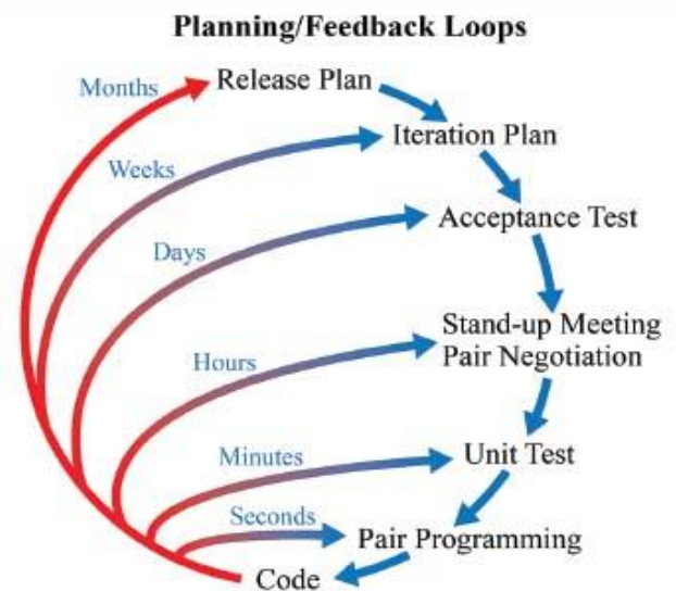
Figure 1. 2 Extreme Programming (XP): Agility Delivery