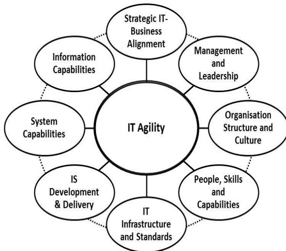
Figure 1. 1 IT Agility Framework

In general, agility is a common business term that refers to how fast an organization responds to opportunities. It is typically recognized as the time in between an organization becoming aware of a potential business opportunity and acting on it.