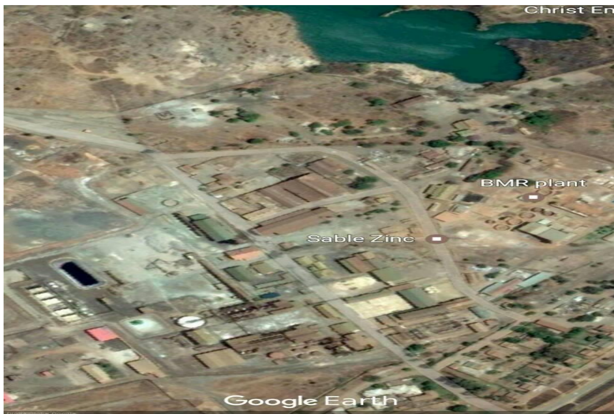
Figure 2. Showing the location of the Broken Hill dumpsite, which is located near Sable Zinc.